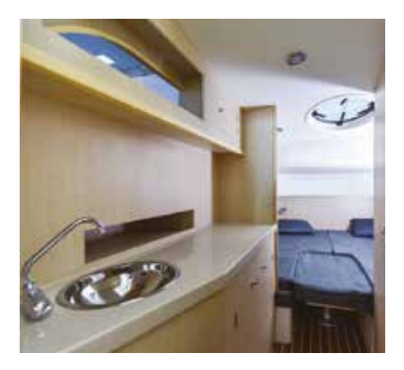
Option 1 Golden Oak Suede Finish